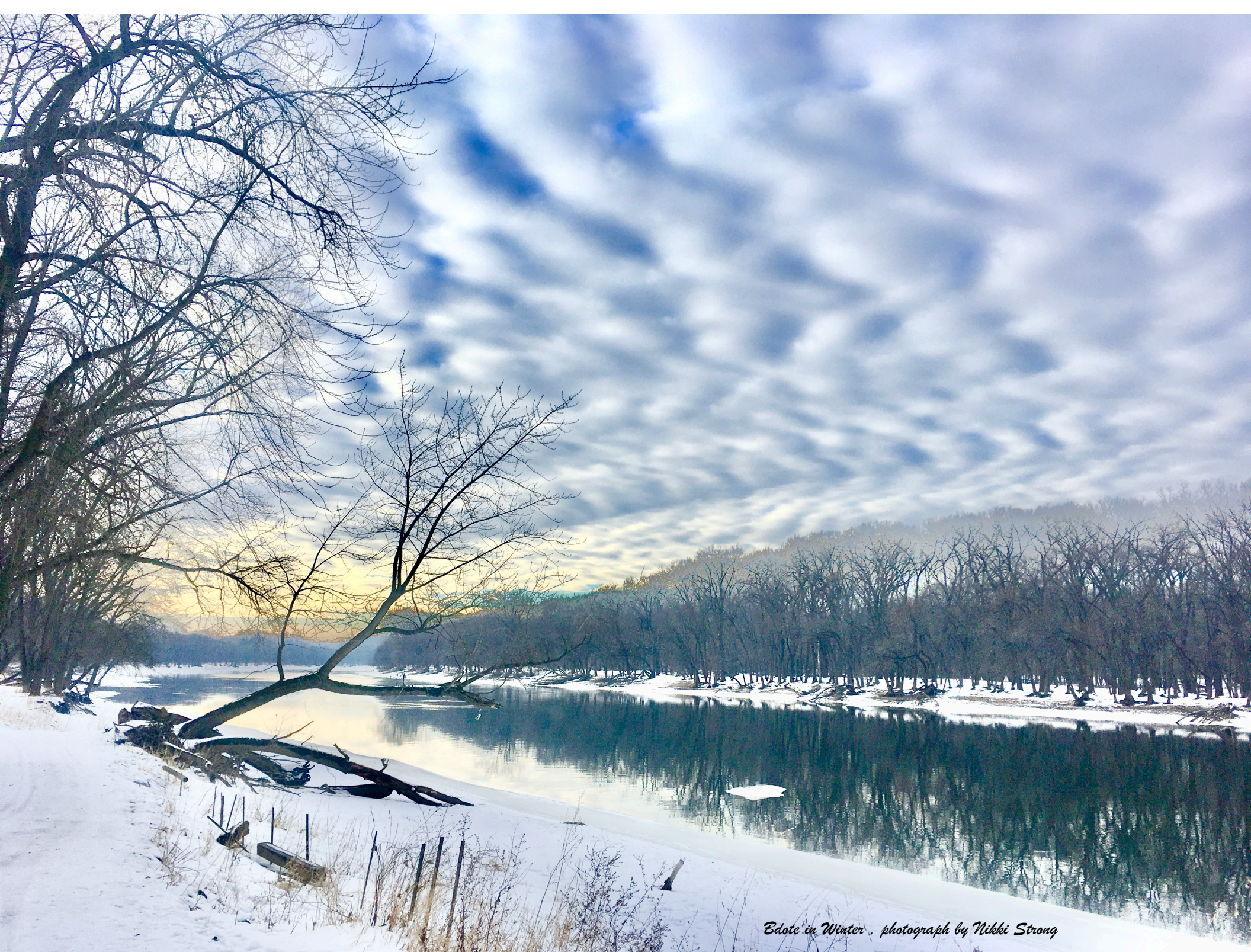
Edote in Winter . photograph by Nikki Strong